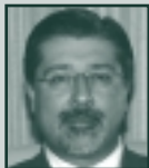
Adnan Amin, Director of the New York Office, UNITED NATIONS ENVIRONMENT PROGRAMME